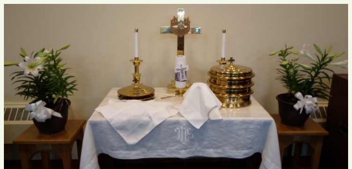
See photos from Holy Week at the Mud Church on Pages 2-3

31 God saw all that he had made, and it was very good. And there was evening, and there was morning—the sixth day.